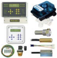
Different backwash set available

400V or 230V filter system. Simple operation, remote maintenance, ASCII interface to bus systems, SMS alert in case of operation errors, Whirlpool operation, universal inputs / outputs, energy saving functions, use of synergies for resource-saving intelligent control, splash-proof, information button to read what is going on, watch with 10 years power reserve, water-proof housing with transparent lid etc.